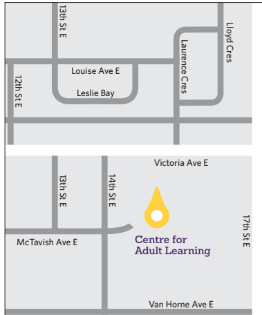
CENTRE FOR ADULT LEARNING - BRANDON VICTORIA AVENUE EAST CAMPUS 1430 VICTORIA AVENUE EAST

It's important that you are able to find the nearest Assiniboine Centre for Adult Learning easily, especially if you are visiting for the first time. Use these maps to find us in Brandon or in Dauphin.