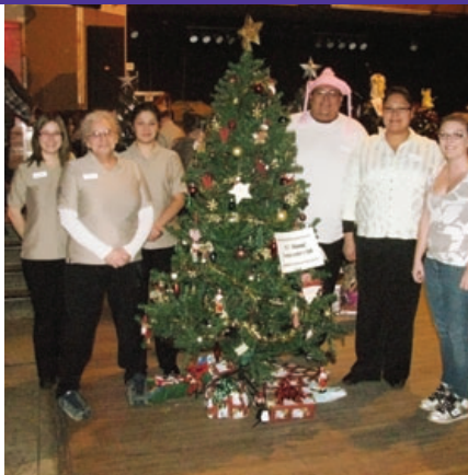
United Way Christmas Tree Auction