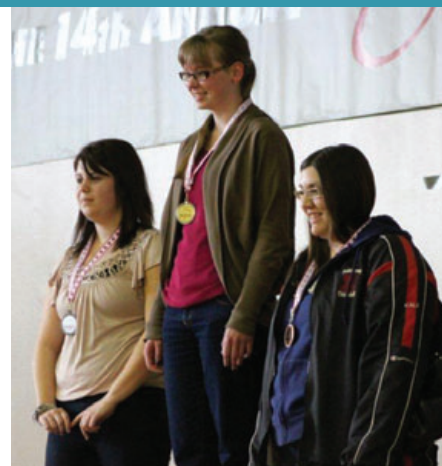
IT Software Solutions Competition

Assiniboine Community College won 24 medals in a race against time at this year's Skills Manitoba competition. More than 500 college and high school students competed in 40 categories at Red River College in May, putting their hands-on training and technical knowledge to the test. An associated Restaurant Service competition was hosted at ACC's 1st Street North Campus, yielding an additional three medals.