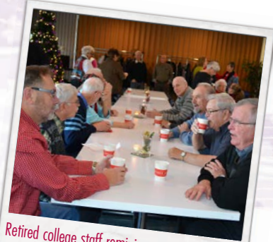
Retired college staff reminisce over coffee at the annual Retirees Coffee Party on December 10.