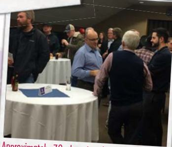
Approximately 70 alumni and staff attended the annual Alumni & Friends Reception at MB Ag Days on January 21.