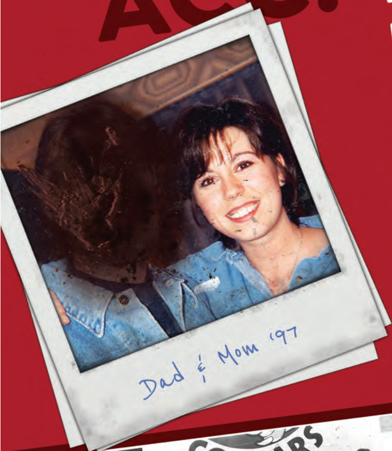
Dad & Mom 197