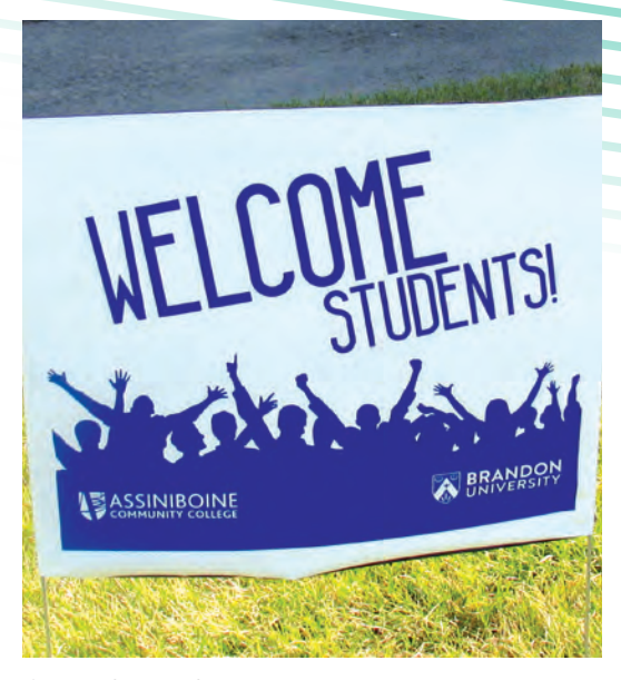
Welcome Students Sign

A new selection of first-year university classes in Dauphin, through Brandon University, allows the two institutions to build on their ongoing partnerships and expand them to the Parkland community. Previous collaborations have included students sharing residence space in Brandon and transferring credit through 2+2 programs. The BU classes are being held at ACC's Parkland Campus.