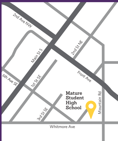
520 WHITMORE AVENUE EAST DAUPHIN, MB