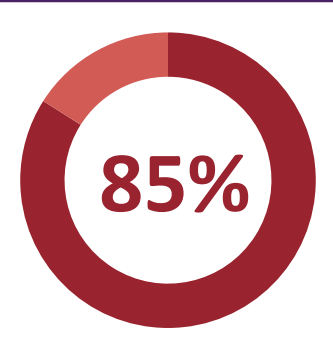
of graduates are working in a career related to their studies

of Assiniboine graduates stay in Manitoba