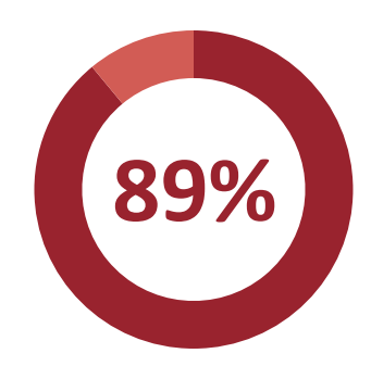
of graduates would recommend Assiniboine to a friend or family member